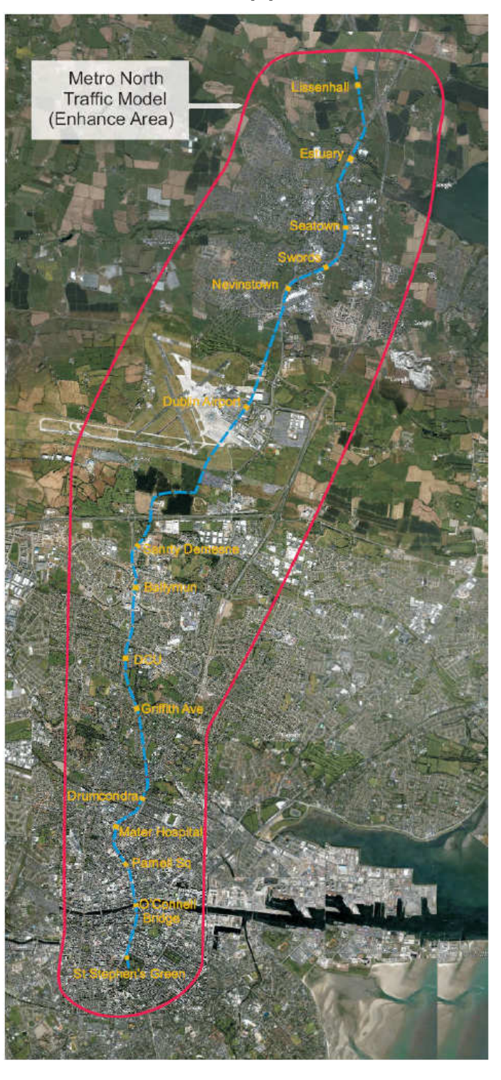
Figure 2.1 Metro North Study (Metro North Traffic Model) Area